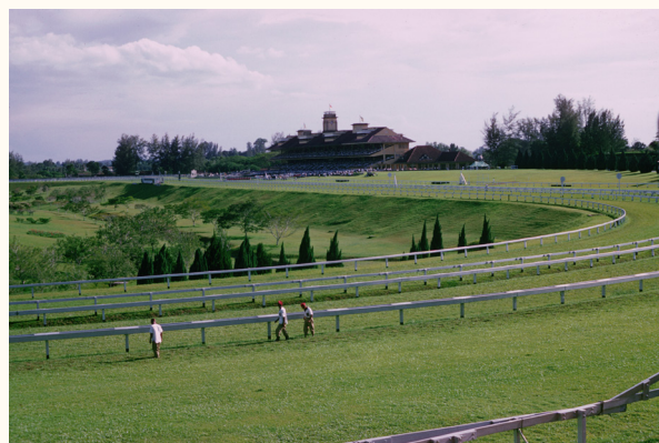
Turf Club, 1950s.

After WWII, horse racing resumed and got more popular, with the Southern Grandstand expanded to increase crowd capacity.