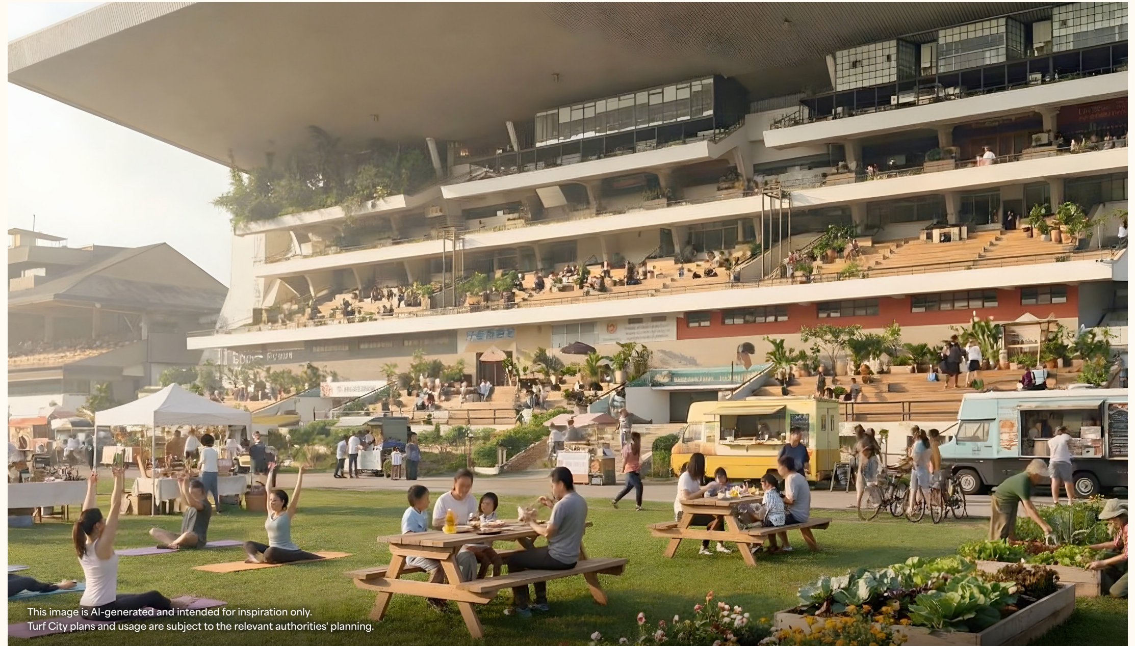
This image is AI-generated and intended for inspiration only. Turf City plans and usage are subject to the relevant authorities' planning.

Drawing inspiration from the prestige of Turf City's equestrian era and Bukit Timah's bucolic countryside landscape, urban planners envision a sprawling yet serene setting that embraces vibrant cosmopolitan living for all. Imagine the former racecourse's iconic oval revolutionised as community centrepiece, while both monumental grandstands anchor the neighborhood's upcoming chapters.