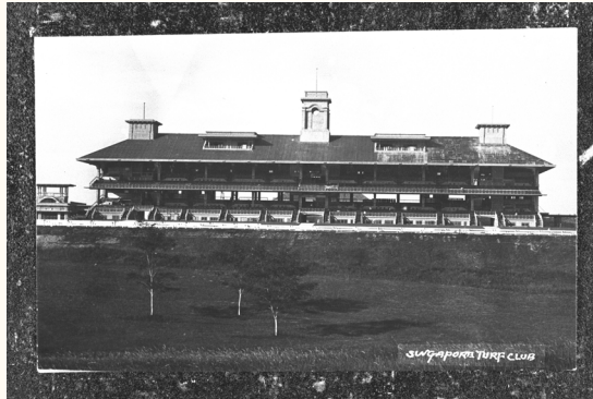
View of the grandstand at Bukit Timah Turf Club, Singapore. 1933.

Singapore Turf Club relocated from Farrer Park to Bukit Timah.