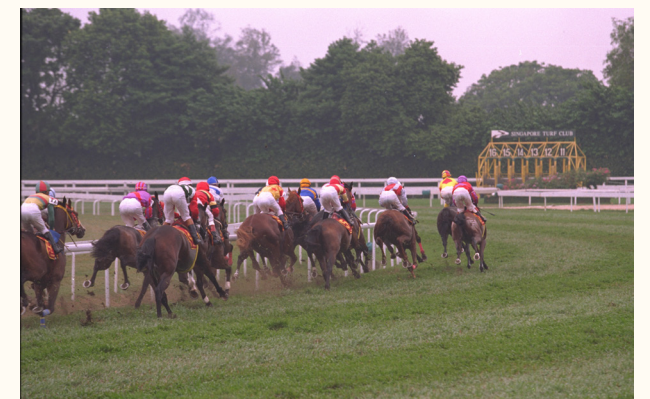
Singapore Gold Cup 1997 at Singapore Turf Club (Bukit Timah Race Course), 1997.

One of the last few races before the Turf Club relocation to Kranji.